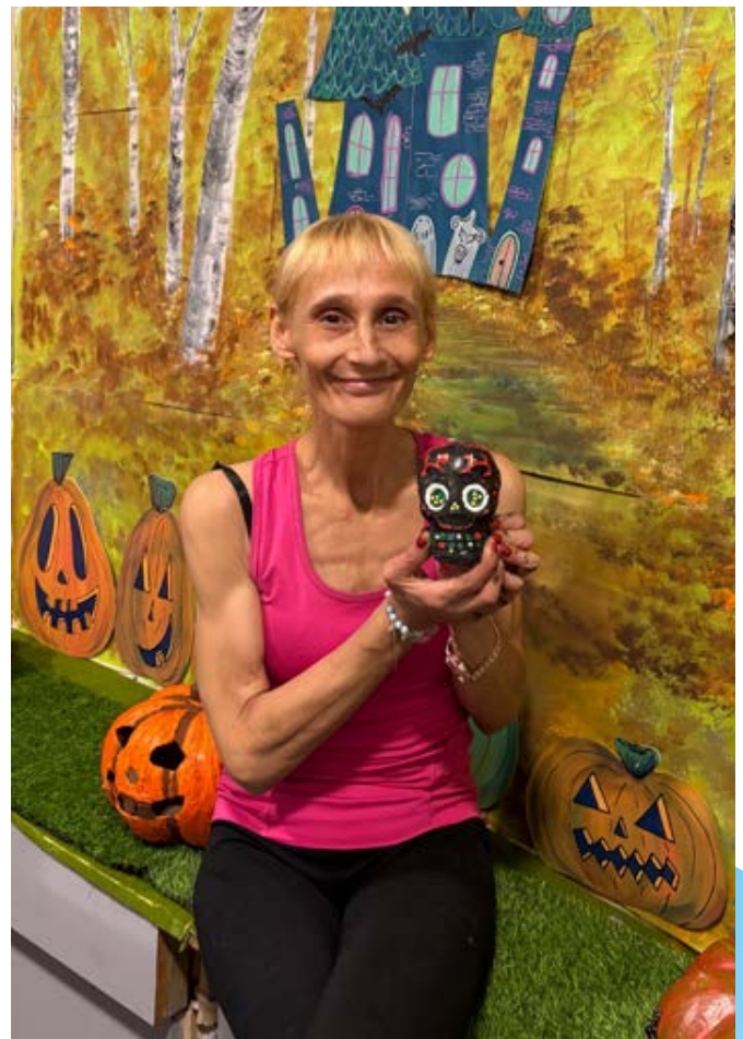
Arts and crafts session