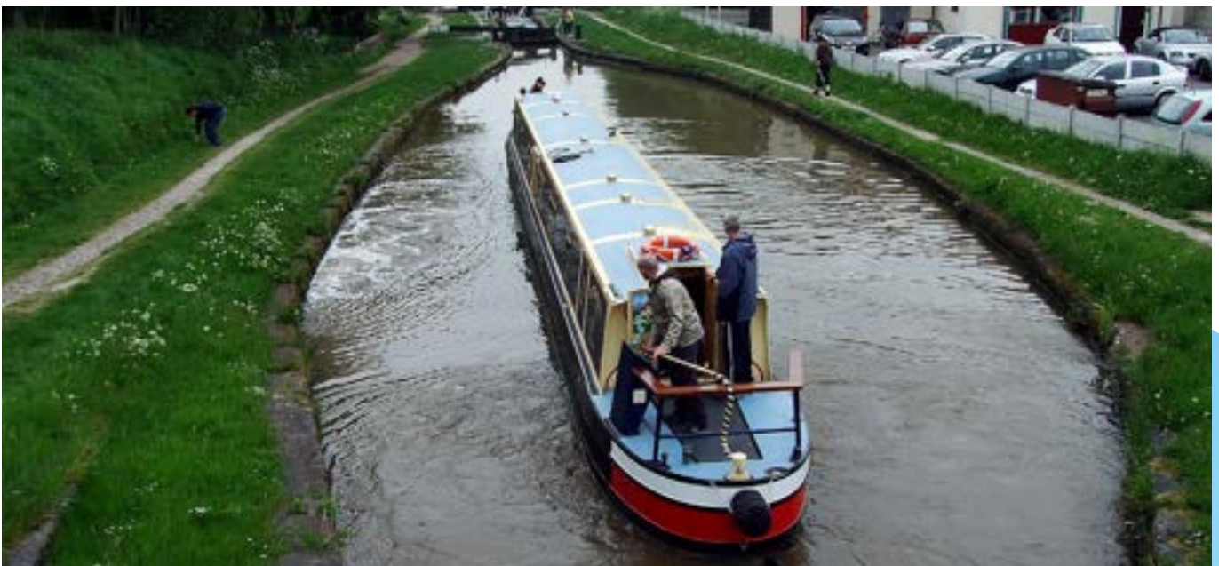
Our narrow boat: The Potential