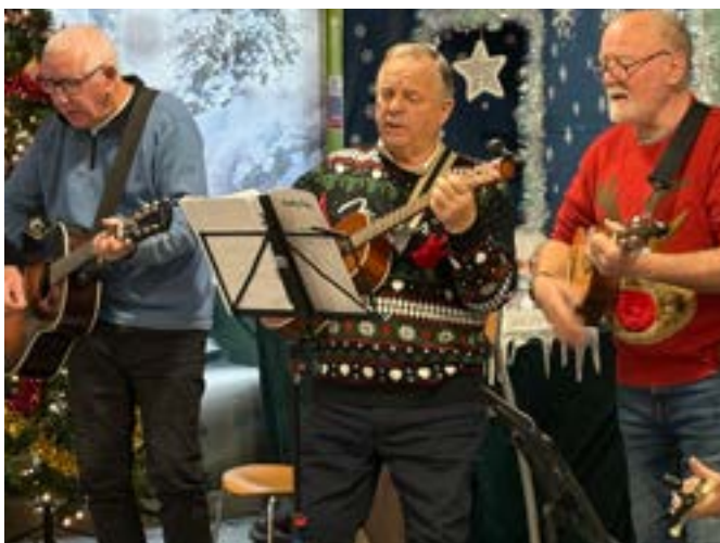
Our annual Ukelele performance

As a result, YMCA Wirral continues to develop a strong and visible profile locally, recognised as both a vital service provider and a constructive community partner.