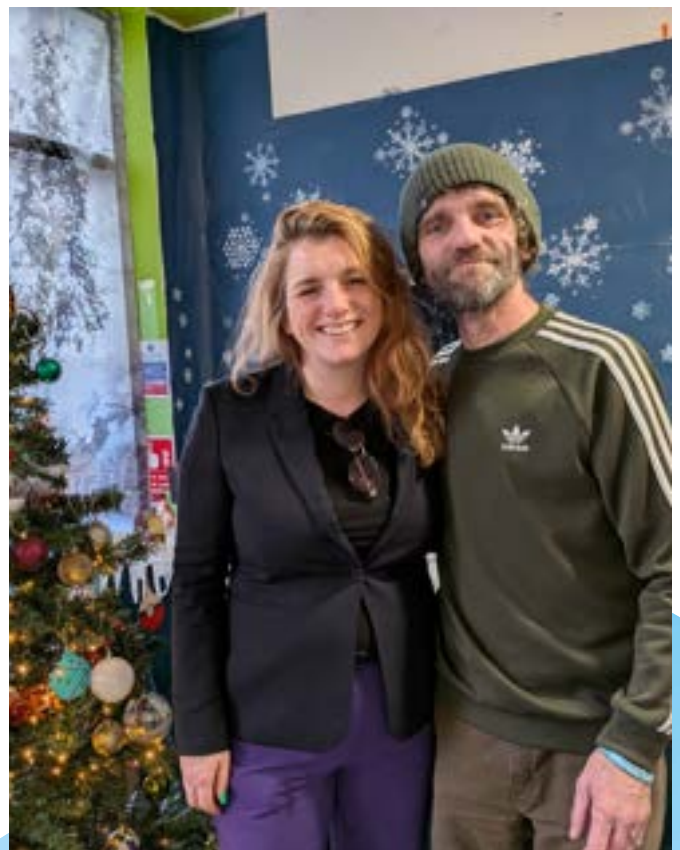
Alison McGovern MP meets our residents

We take resident feedback onboard to plan day trips such as hikes. A client-led programme of activities is key to empowerment, productive activity, and wellbeing.