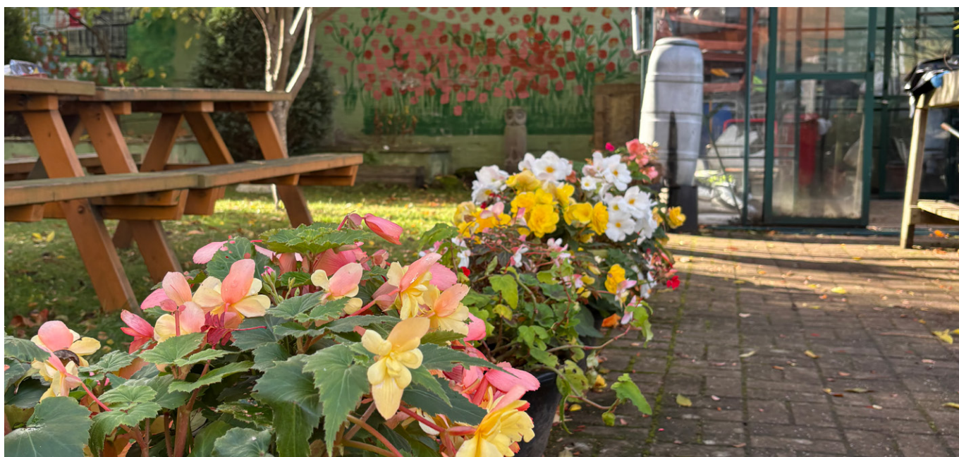
The garden in bloom

Our psychologically informed approach is not a fixed model, but an evolving framework that helps us embed good practice, learn collectively, and respond more effectively to the complex and diverse needs of our community.