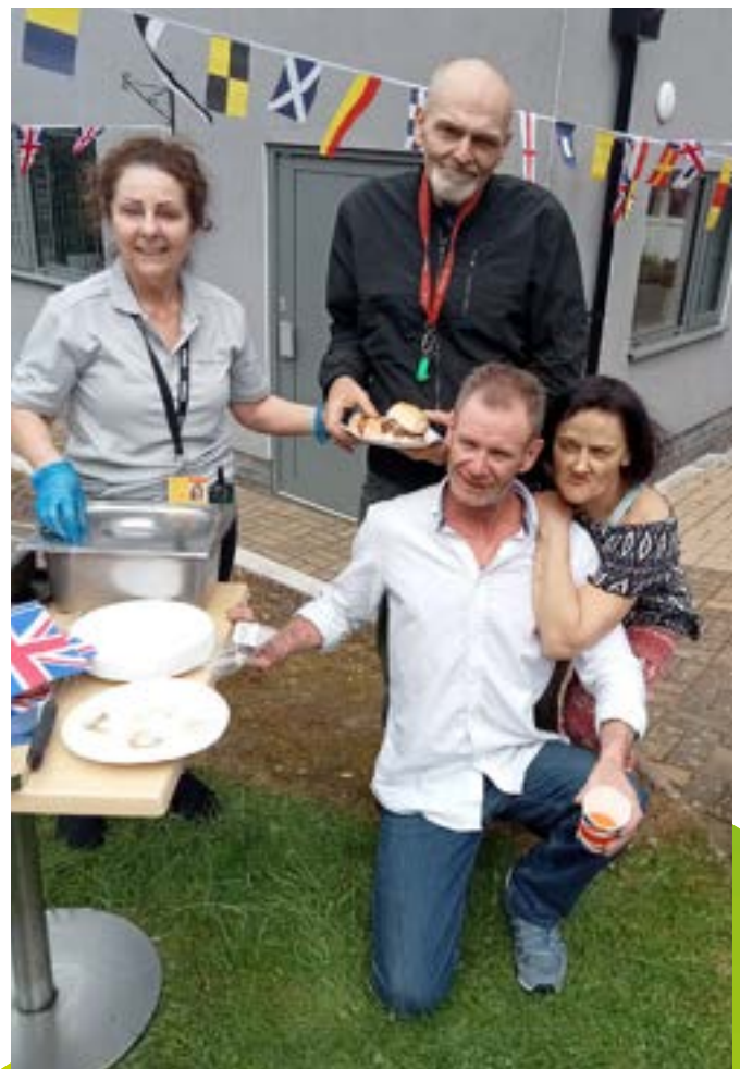
In-house international BBQ

This partnership strengthens our holistic approach to care, ensuring that alongside safe accommodation, residents are empowered with the knowledge and tools they need to overcome barriers and move towards independence. It represents a significant step in providing integrated support that addresses both immediate needs and longer-term stability.